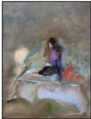
Mystique watercolor 9.5 x 7.5 framed 16 x 14 $400